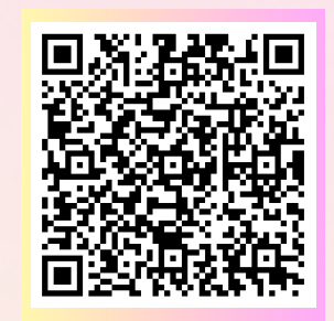
Scan QR Code for More Information